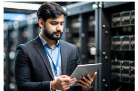
Mini Datacenters, Server Rooms & Battery Rooms