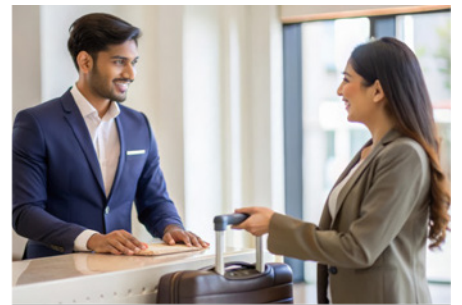
Hotels and Restaurants