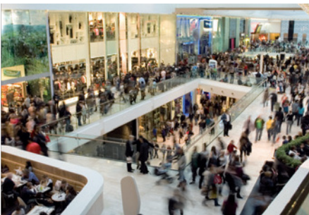
Retail & Showrooms