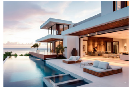
Luxury Residential Villas