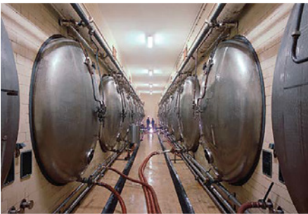
Distillation & Breweries