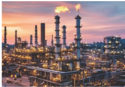
Petroleum / Petro chemicals