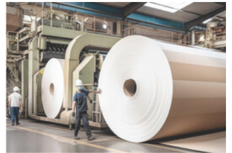
Pulp & paper