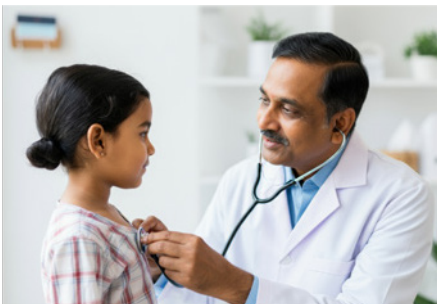
Hospitals, Clinics & Diagnostics